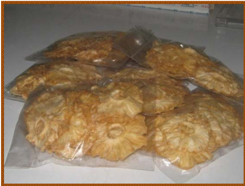
Air-dried pineapple fruits at 8 months storage under at 18 \pm 2 °C and 78 \pm 4 % RH