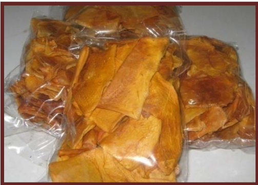
Air-dried mango fruits at 8 months' storage under at 18 \pm 2 °C and 78 \pm 4 % RH