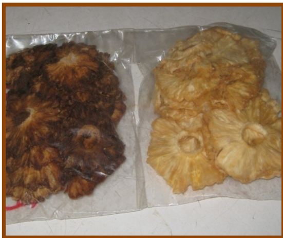
Air-dried pineapple fruits: Left: Under room condition Right: Under chilled room condition