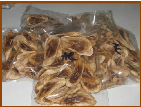
Air-dried banana fruits at 8 months storage under at 18 \pm 2 °C and 78 \pm 4 % RH