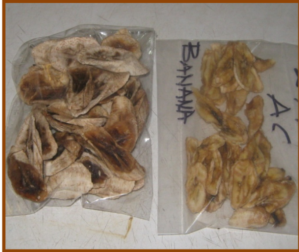
Air-dried banana fruits: Left: Under room condition Right: Under chilled room condition.

As shown in the two sets of pictures in Figures 4 and 5, there is excessive non-enzymatic browning of the dried pineapple and banana samples under the room conditions. This will certainly be unacceptable to consumers as indicated by the panel scores in Tables 8 and 9.