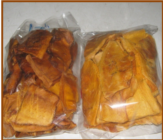
Air-dried mango fruits: Left: Under room condition Right: Under chilled room condition.

As shown in the two sets of pictures in Figures 4 and 5, there is excessive non-enzymatic browning of the dried pineapple and banana samples under the room conditions. This will certainly be unacceptable to consumers as indicated by the panel scores in Tables 8 and 9.