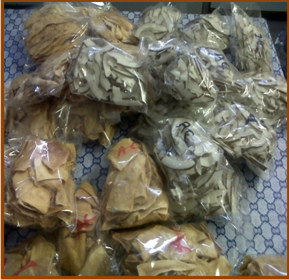
Air-dried mango fruit and Coconut slices under chilled room condition.