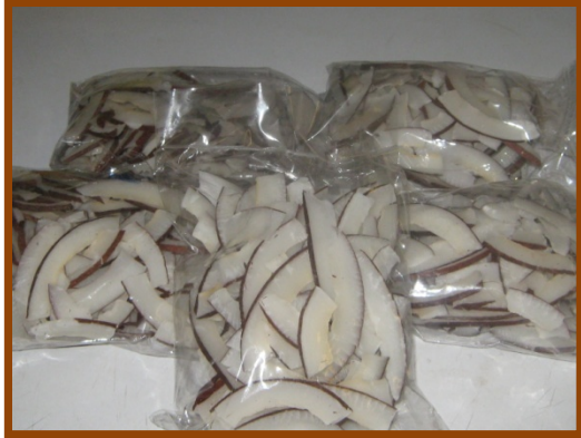
Air-dried desiccated coconut fruits at 8 months storage under at 18 \pm 2 °C and 78 \pm 4 % RH