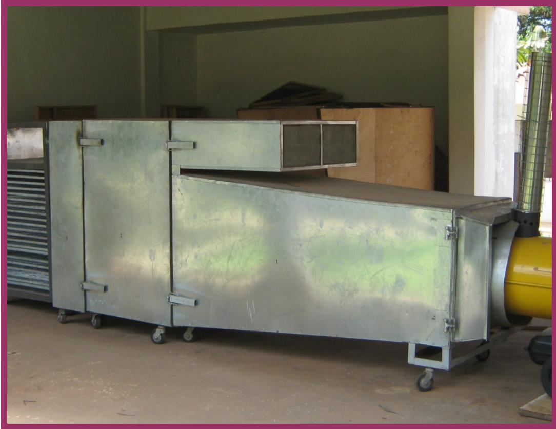
Fig. 1: The Developed Mobile Tunnel Dryer Used to Dry the Fruits

Operating Conditions: 68 \pm 3^{\circ}\text{C} for 10 h