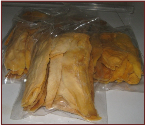
This picture shows that the colour of the dried mango to be fading at the 12 month storage