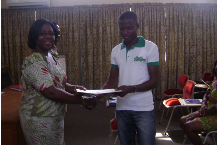
Participant from Benin receiving his certificate from the Unit Head