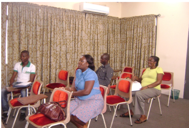
Participants during the 1 st lectures