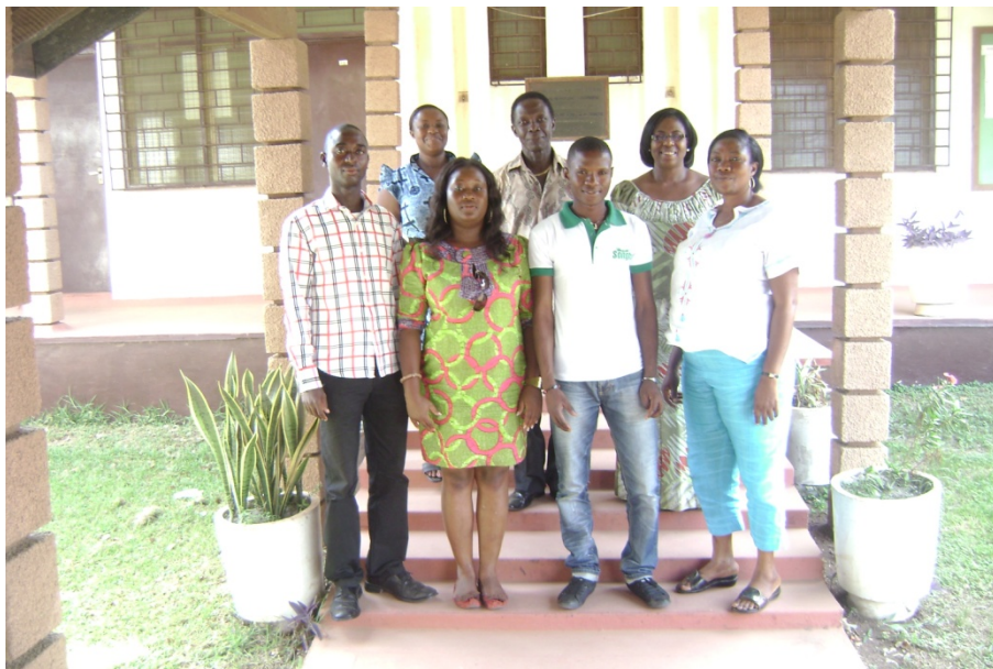
Picture of resource persons with the participants