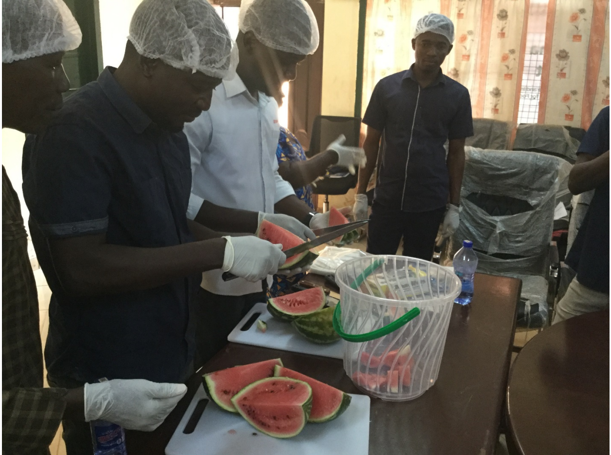
Figure 8: Participants peeling watermelon fruits