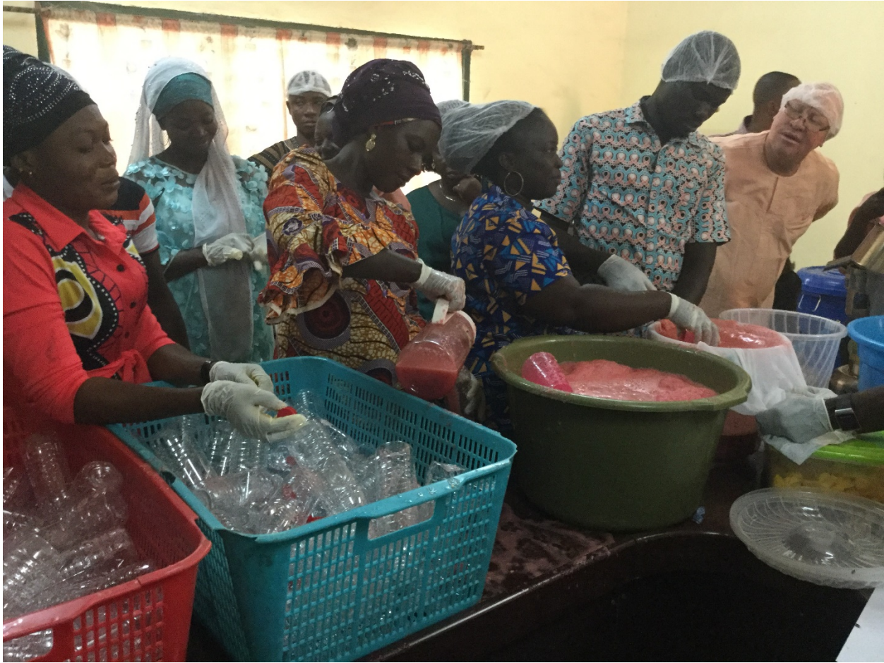
Figure 11: Participants filling bottles with extracted juices