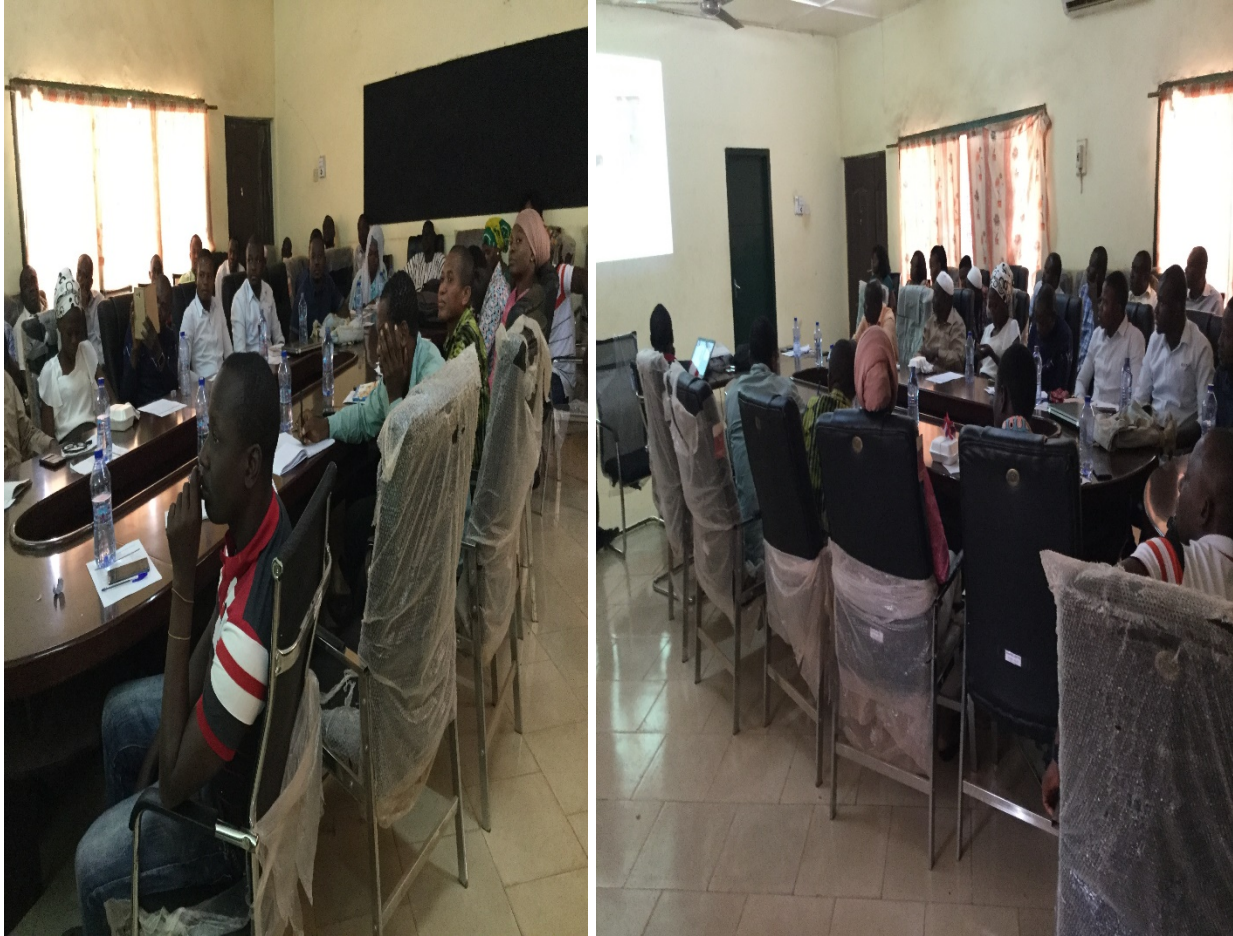
Figure 5: A section of participants