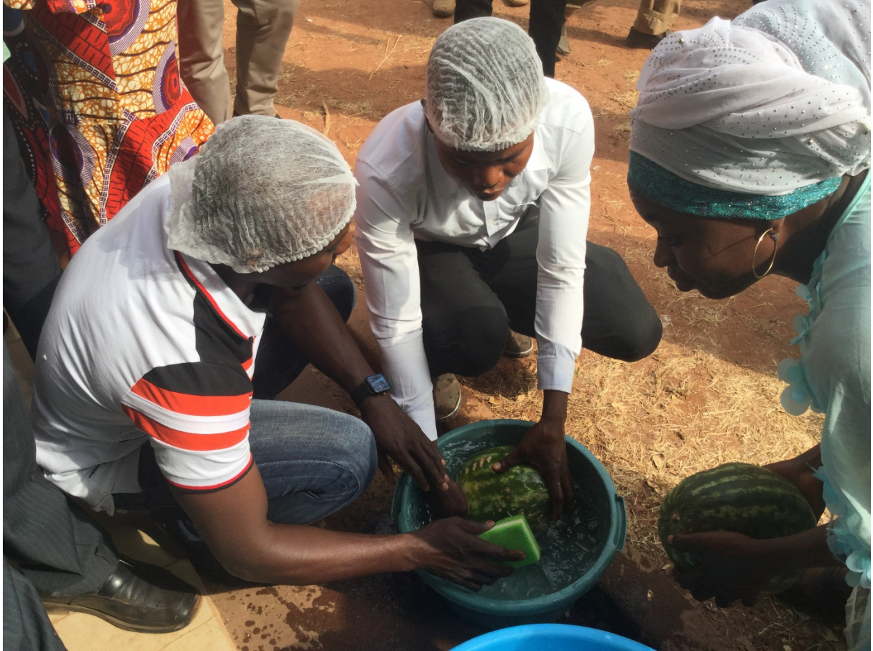
Figure 7: Participants washing fruits