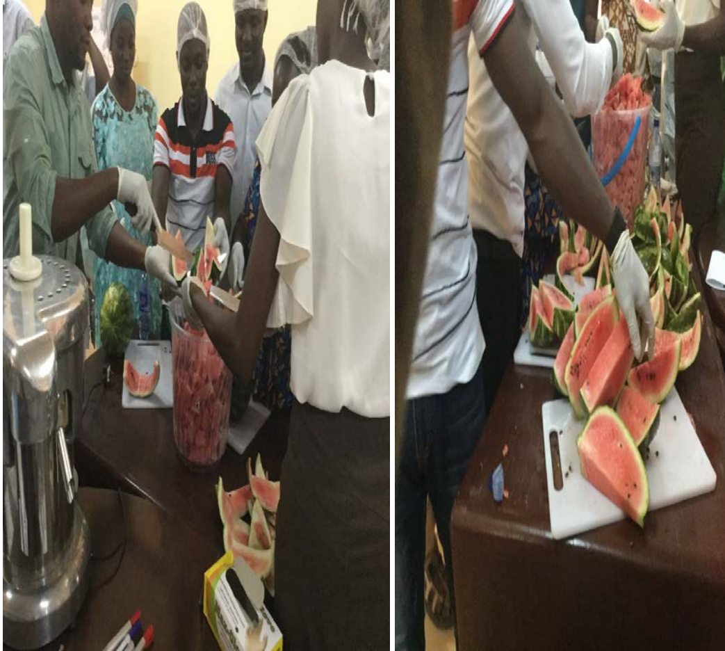
Figure 9: Participants cutting watermelons