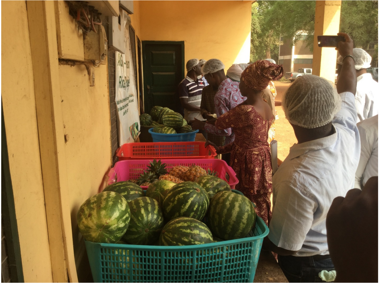
Figure 6: Participants sorting fruits