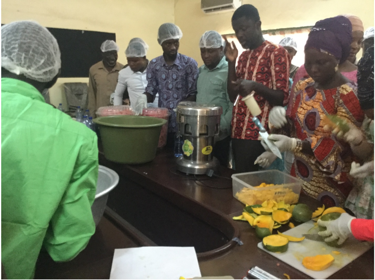
Figure 10: Participants cutting mangoes