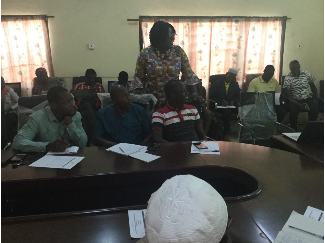
Figure 2: Delivering of lectures by CSIR-FRI MAG Focal person