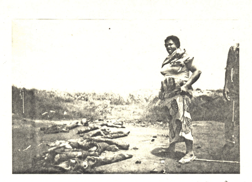
FIG. I. Rolled cattle hides to the left front of picture.