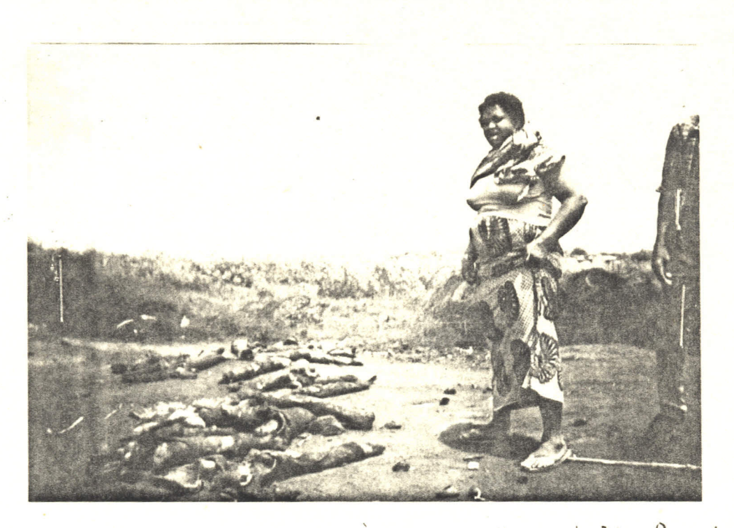
FIG. I. Rolled cattle hides to the left front of picture.