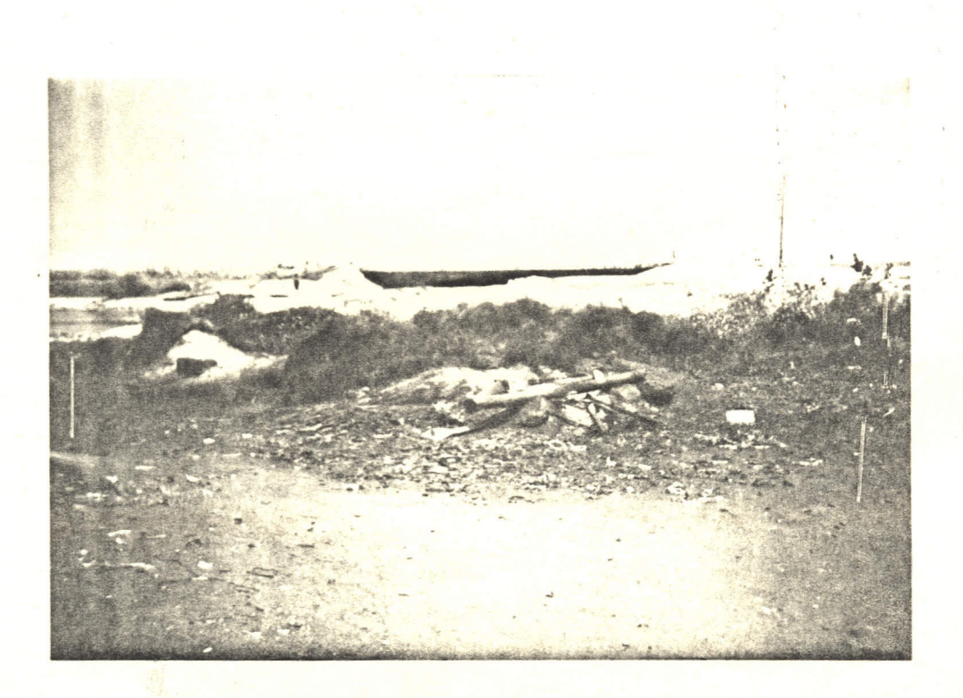
FIG. II. To the background, behind the fire place shows a pile of screp wires