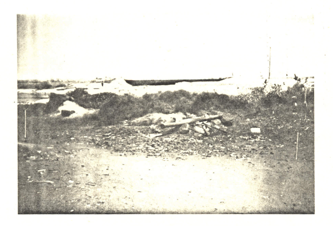
FIG. II. To the background, behind the fire place shows a pile of scrap wires Obtained after burning types.