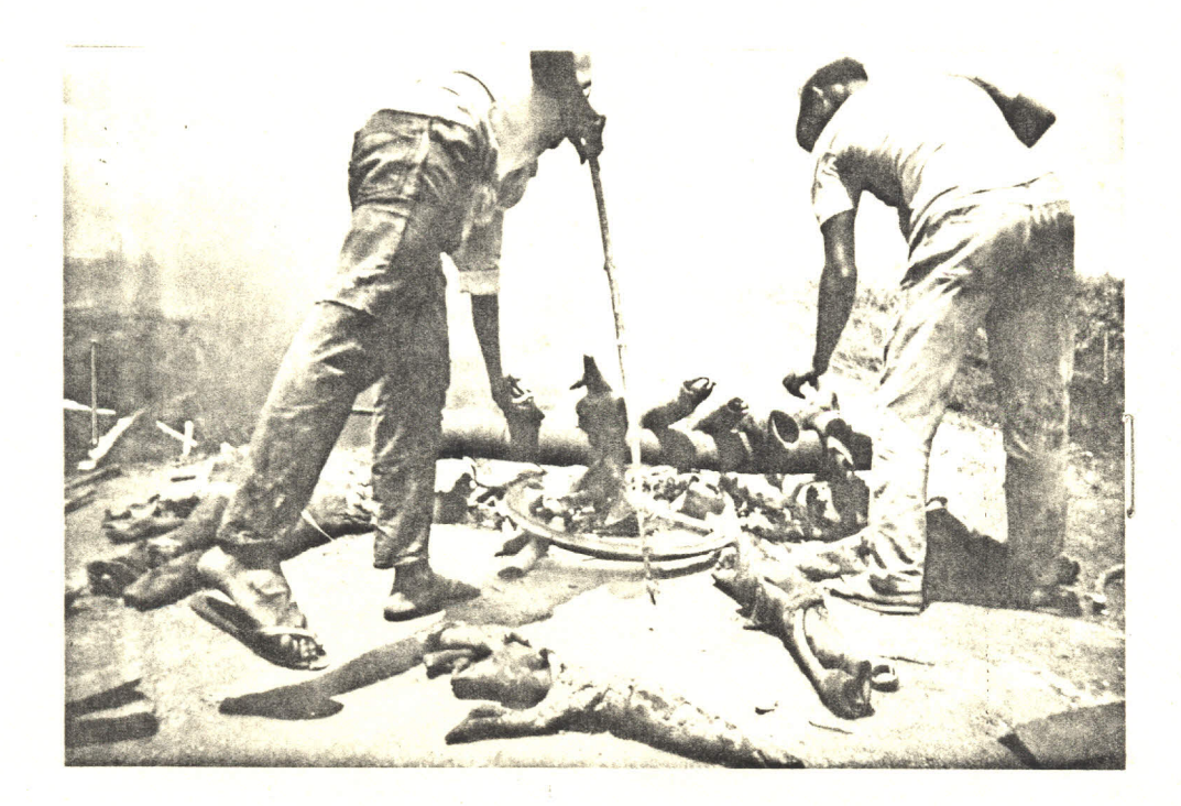
FIG. III. Picture shows rolled cattle hides being singled in the fireplace.

The fireplace is constructed with car type. rims or block of stones arranged in two parallel lines and separated by a distance of about one meter. On top and across these supports are placed two parallel cylindrical metal rails. The fire is made below this affangement and the rolled hides are placed (one next to the other) on the rails (Fig. III below). The heat from the fire (produced by the burning types) burns the exposed hair off the hide. With intermittent turning, all the hair on the rolled hide will be burnt away and the hide is removed from the rails.