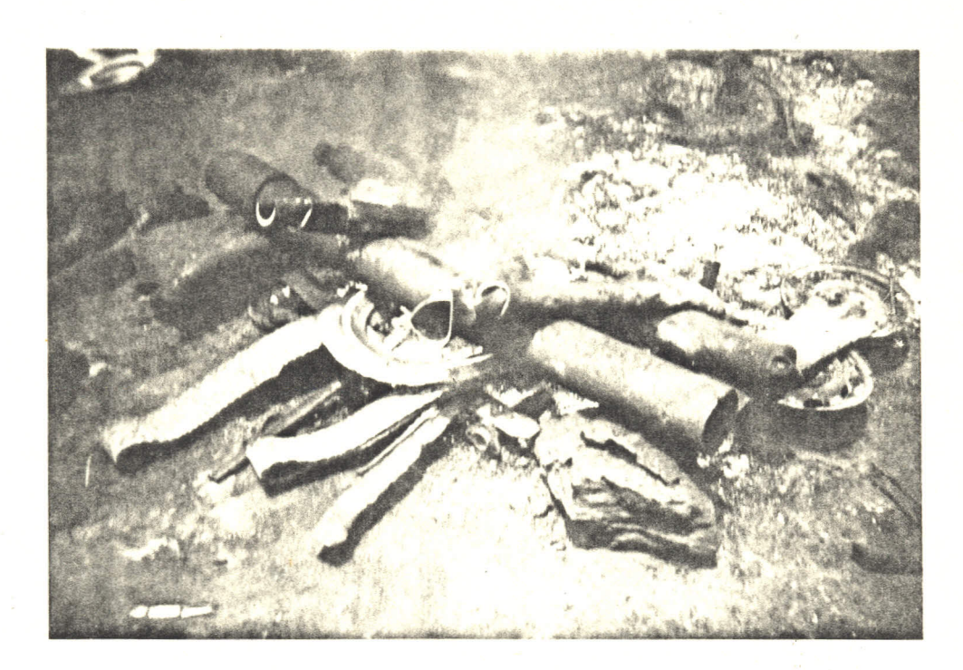
FIG. II. Picture shows scrap types being burnt to singe cattle hides.